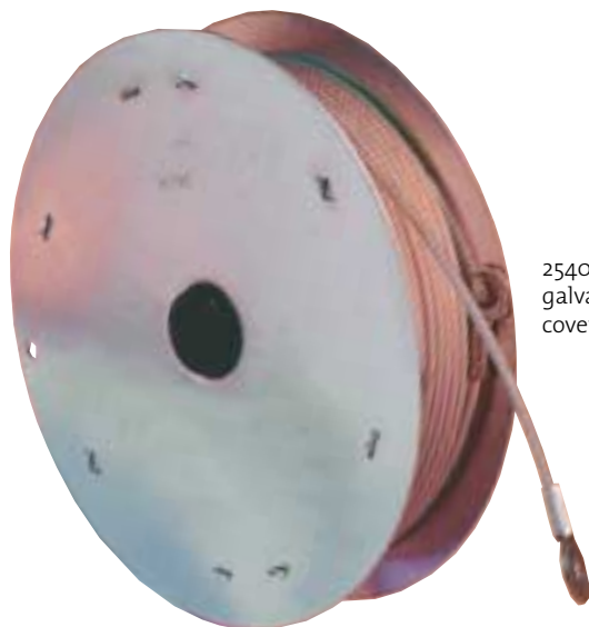
2540mm of 1.65 diameter 4x7 galvanised steel wire nylon covered 2.62 o/d.

This standard option has many applications, used in the assistance of door opening in tube trains and lifts through to counterbalancing of hospital x-ray equipment.